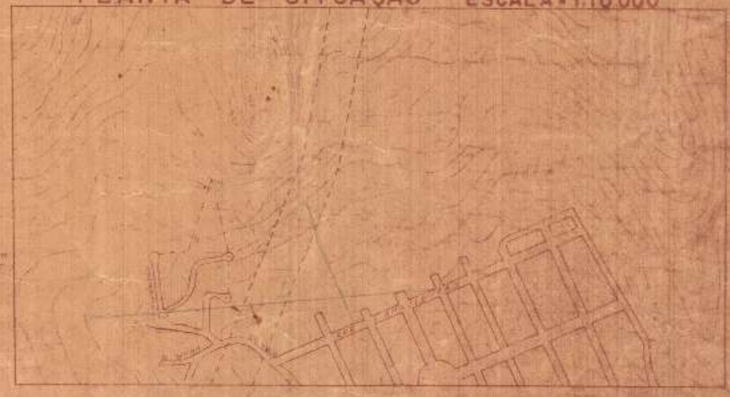
PLANTA DE SITUAÇÃO ESCALA = 1:10.000

RETIFICAÇÃO DA COTA 350' PARA 345' NA LATERAL DIREITA DO LOTE 54, DE ACORDO COM O DESPACHE Nº 34.100/55 EM 24-11-55 DO PROFISSOR JACQUES TAVARES